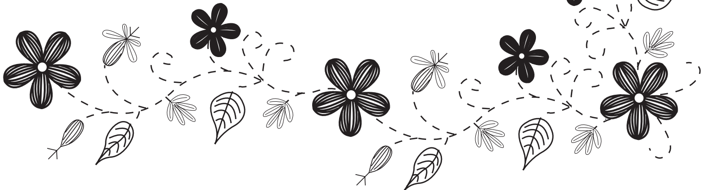
Midnight Floral Afghan Placement Diagram