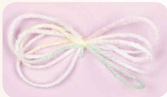
Close-up of Baby Bubbles pattern.